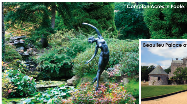
Compton Acres in Poole.

If you enjoy visiting stately homes then Kingston Lacey is not to be missed. A lavish family home built in 1663 and designed to resemble an Italian Palace it is now owned by the National Trust. Another beautiful property we recommend visiting in nearby Fordingbridge is Braemore House, a stunning Elizabethan manor house which is famous for its fine collection of paintings and furniture.