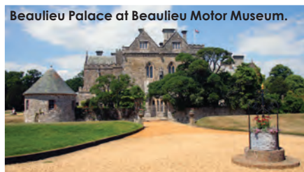
Beaulieu Palace at Beaulieu Motor Museum.

“Thank you for making our stay such an enjoyable one”